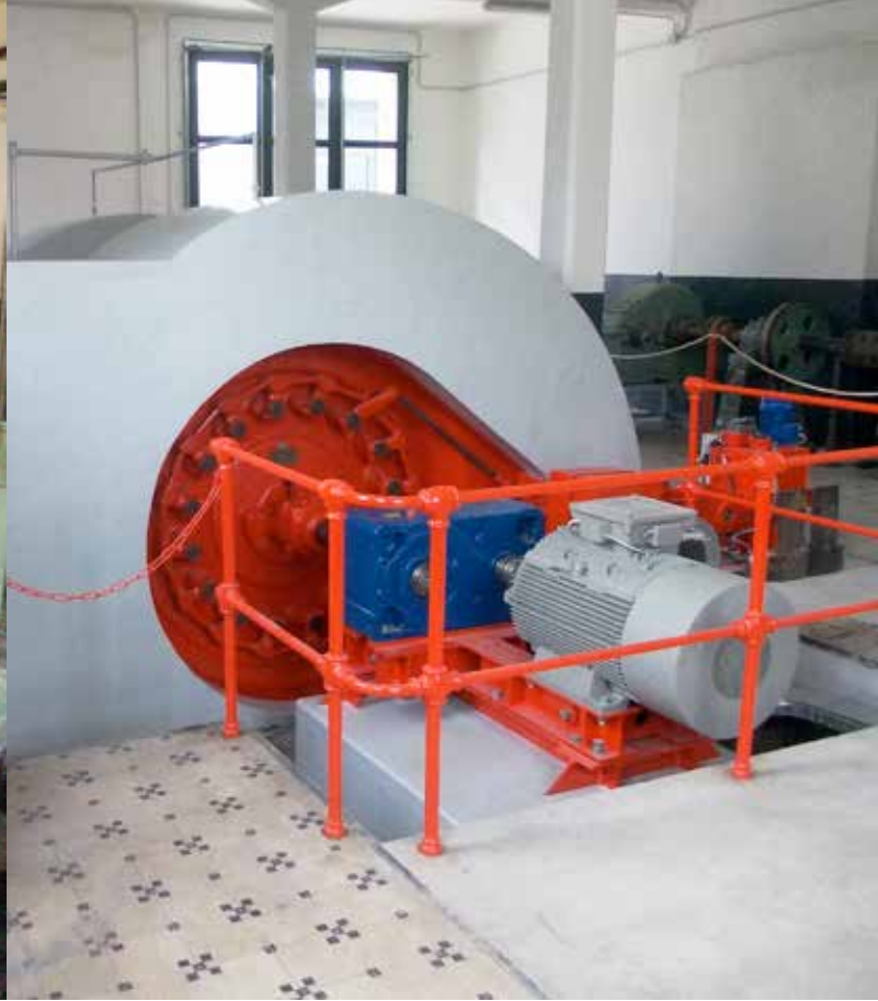
Revamping of a double horizontal-axis Francis turbine