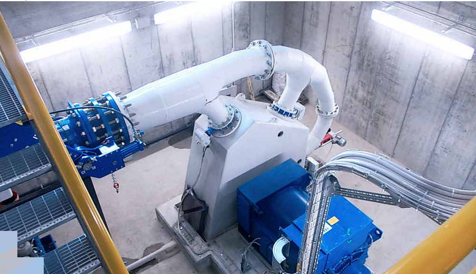
Three-jet Pelton turbine