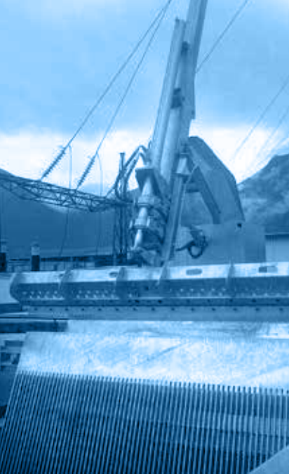
Telescopic arm trashracker